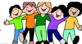
Kids in grades 1-5 growing with Jesus

Thank you to all the volunteers for making this a wonderful time for our Young Warriors and all the kids that attended. I know that they were able to dive into friendship with God because of you.