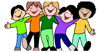
Kids in grades 1-5 growing with Jesus